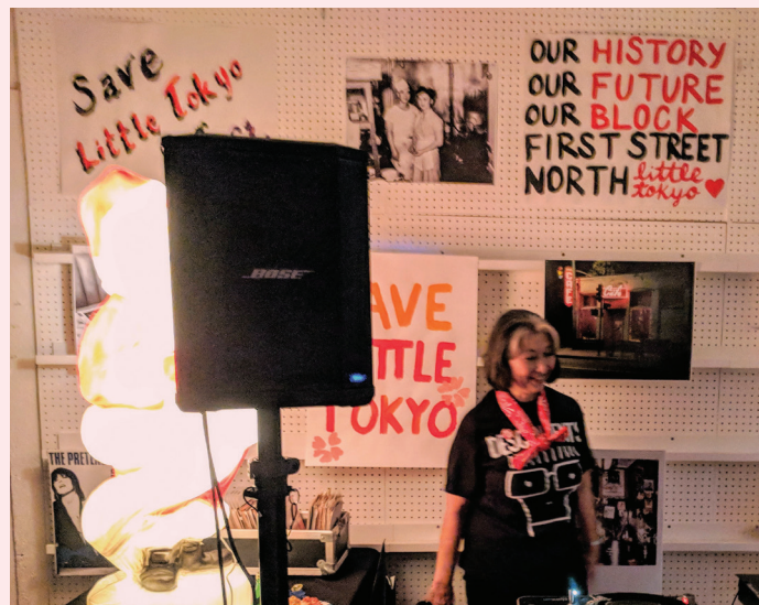
"Atomic Nancy" spins records at the closing night of awareness-raising and SLT-sponsored ART@341.